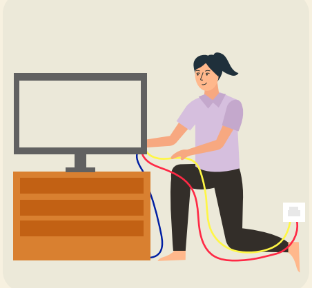
Loose items lying around or loose wires on the floor