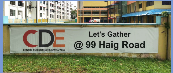
Let's Gather @ 99 Haig Road

A new space for MDWs to spend your rest days. Open on every Sunday till end of July.