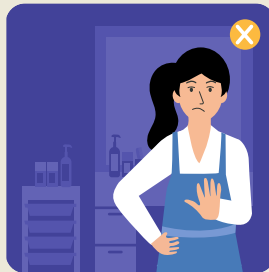
Working in a hair salon or massage parlour