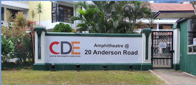
Amphitheatre @ 20 Anderson Road

Do not know where to go or what to do during your rest day? Explore these places specially catered for all MDWs.