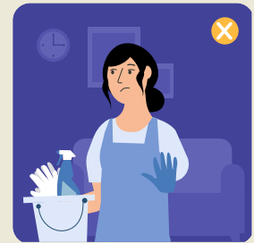
Cleaning someone else's house