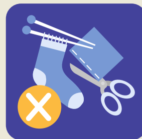
Selling of goods or handicrafts