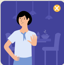
Working in a restaurant

If you are working in another job other than for your official employer, be it full-time or part time.